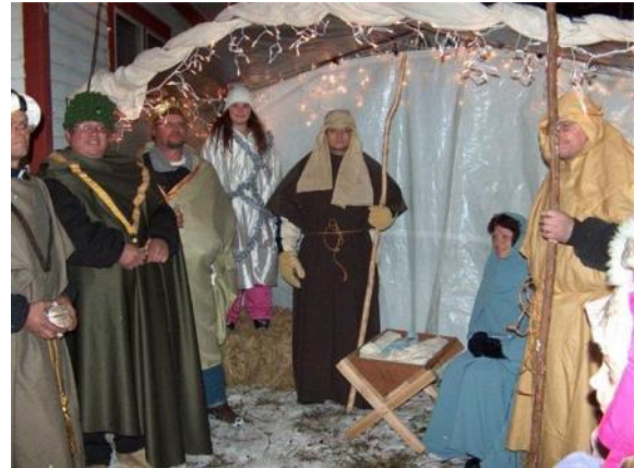
The live nativity scene.

Let the joy and wonder of the season live long in our hearts and be ever present in our community. Happy New Year!