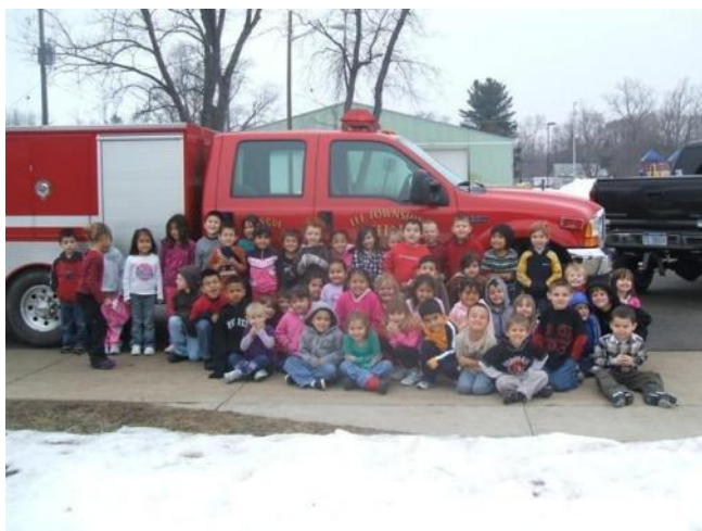
The fire trucks are always a big hit with the students at Pullman Elementary.