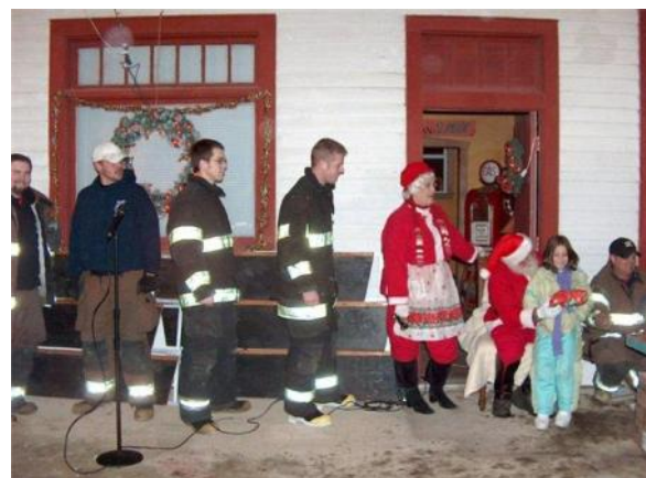
Lee Township Firefighters help hand out gifts.