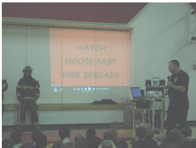
Lee Township Volunteer Fire Department shared important safety information with students at Pullman Elementary.