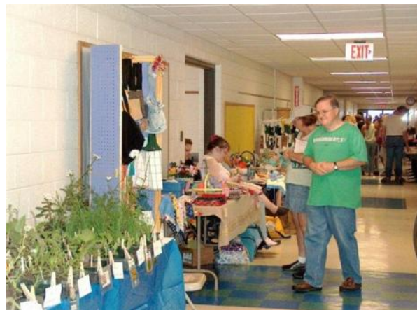
Pullman Elementary School hall is filled with crafters for Pullman Pride Day